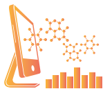
Screening and optimization of culture media

Sacco System stands out as a reliable and complete partner. We are specialized in managing production and scientific complexities, allowing you to focus on your core business. We offer expertise on Probiotics and Postbiotics providing versatile solutions based on your needs.